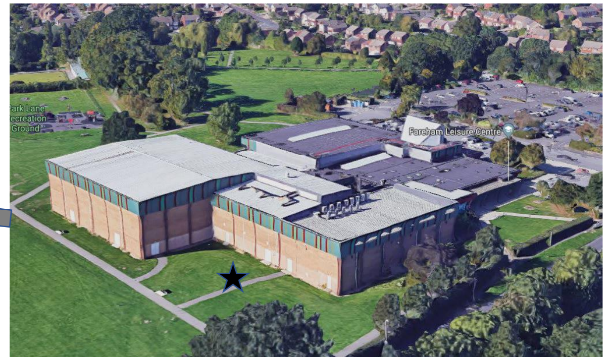
Area proposed for extension - 617m 2