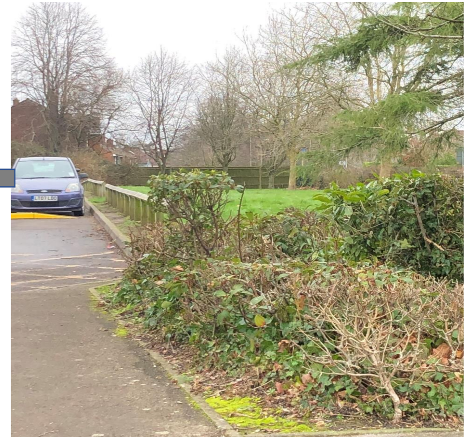
Grass area proposed for car park extension (32 additional bays)